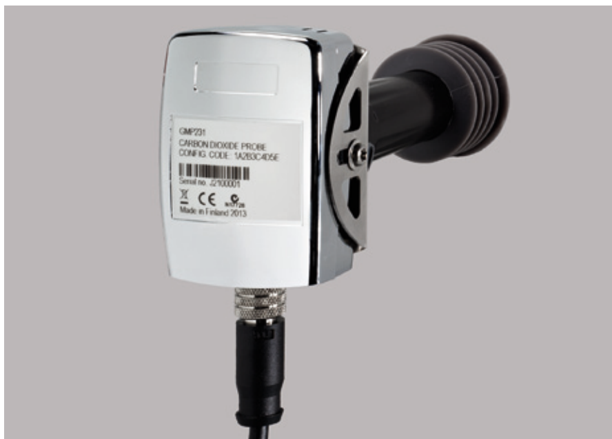
The Vaisala CARBOCAP® Carbon Dioxide Probe GMP231 withstands high temperature sterilization.

The Vaisala CARBOCAP® Carbon Dioxide Probe GMP231 is designed to provide incubator manufacturers with accurate and reliable carbon dioxide measurements and sterilization durability at high temperatures. The probe is based on Vaisala's patented CARBOCAP® technology and a new type of infrared (IR) light source. These technologies allow for sterilization temperatures of up to 180 °C, enabling easier and more complete sterilization without the risk of cross contamination.