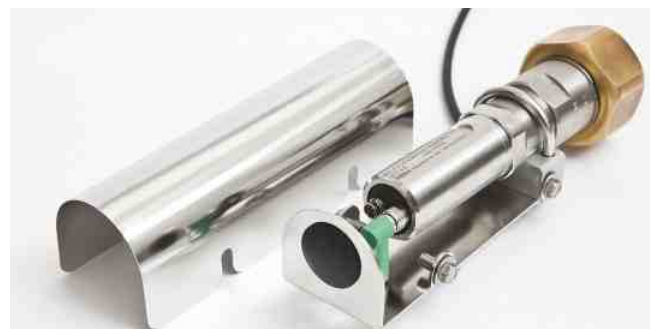
The DPT145 with the weather shield.

Vaisala has over 70 years of extensive measurement experience and knowledge. The DPT145 brings together the proven DRYCAP® dew point sensor technology and BAROCAP® pressure sensor technology in one package, providing an innovative and convenient solution for monitoring SF6 gas.