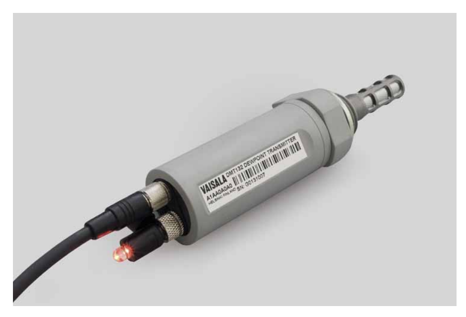
The optional LED warning light tells the user when the defined dew point limit has been exceeded.

The Vaisala HUMICAP® Dewpoint Transmitter DMT132 is an affordable dew point measurement instrument designed to verify the functionality of refrigerant dryers. It is especially well suited for OEM dryer manufacturers.