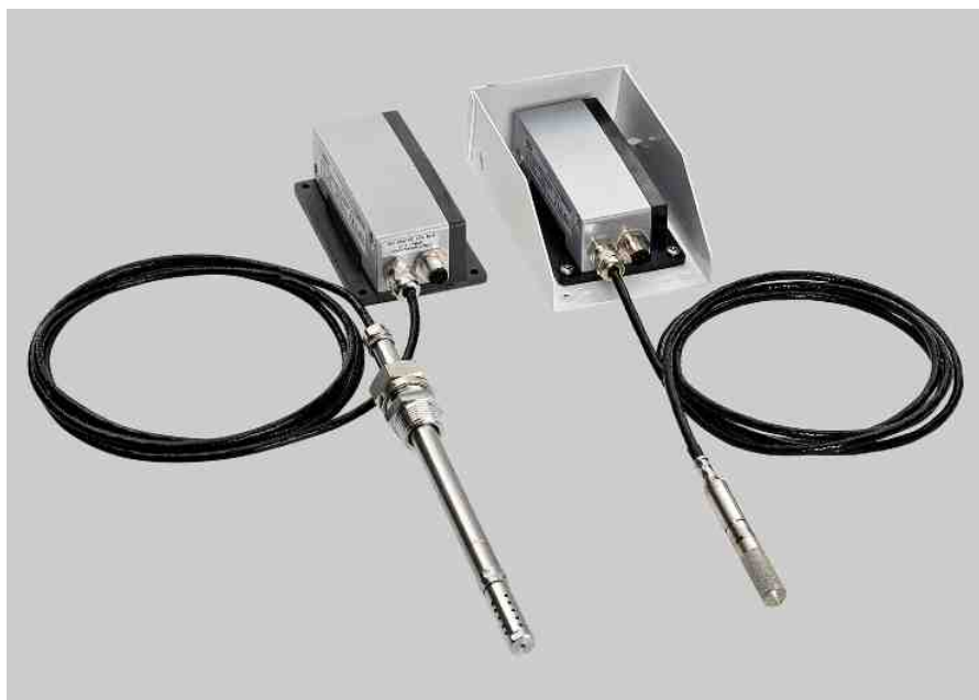
Two probe options: MMT318 and MMT317. Optional rain shield is also available.